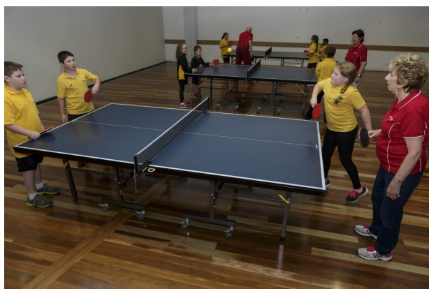
Table Tennis for Over 50s meet Mondays at 1pm, Thursdays at 12 noon and most Fridays from 12 noon (please check with the office for not running dates). Cost is just $4 per session with this friendly group.

We could not have started this inter-generational partnership without the dedicated members of our own Beaconsfield Seniors Table Tennis Club. We are very grateful to each and every one of them for their hard work and great efforts with the children. Everybody left the hall with a smile on their face which is so wonderful to see.